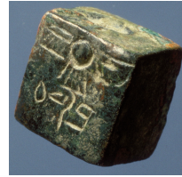
FIGURE 2: Metal beka-weight 29

A.2 A First Temple period beka weight was discovered during the sifting project of archaeological soil originating from the Western Wall foundations in the Emek Tzurim National Park under auspices of the City of David Foundation. The find is interesting, because the weight was inscribed in mirror script (see Fig. 3, below), which suggests that the craftsman was used to create seals and to writing in mirror script. 30