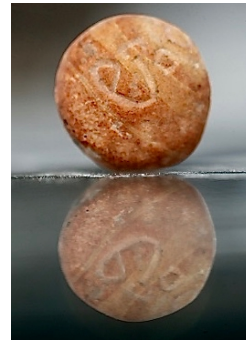
FIGURE 3: Beka weight inscribed in mirror script. 31